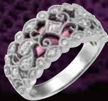
18. Platinum • 18K Diamond Pendant Necklace 19. Platinum • K18 Diamond Ring 20. Platinum • K18 Diamond Earrings